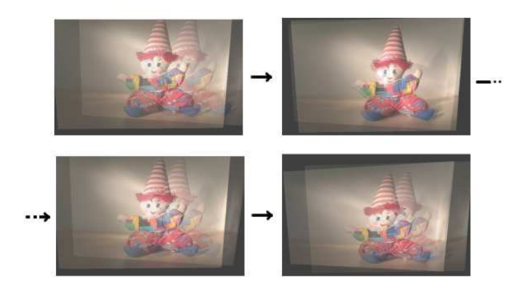
Figure 2. Four pictures associated to four steps of the algorithm using two input cameras.

Yang et al. [10] propose an implementation of the plane-sweeping algorithm using pixel shaders and reach real-time rendering using five input cameras. For the scoring stage, they choose a reference camera that is closest to cam<sub>x</sub> and pairwise compare the contribution of each input image with the reference image. According to the small number of instructions, this method provides good speed results, however the occlusions are not handled. This method also implies geometric constraints on the position of the cameras: the input cameras have to be close to each other and the navigation of the virtual camera should lie between the viewpoints of the input cameras, otherwise the reference camera may not be representative of cam_x . Lastly, there may appear discontinuities in the computed images when the virtual camera moves and changes its reference camera.