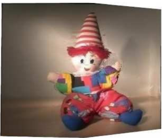
Figure 4. Two real-time images from three input cameras (20 fps with 30 planes).