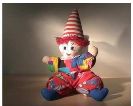
Figure 3. Three input calibrated images.