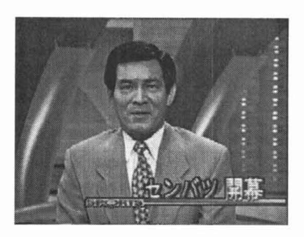
Figure 7: An example of a sports news article

In this paper, we propose a new method for aligning articles in TV newscasts and newspapers. The obtained results contributes to the information retrieval and multimedia. For example, the results are