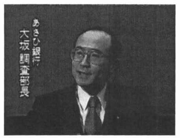
(a) texts in the quarter region of left side