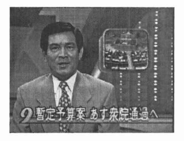
Figure 4: An example of title texts