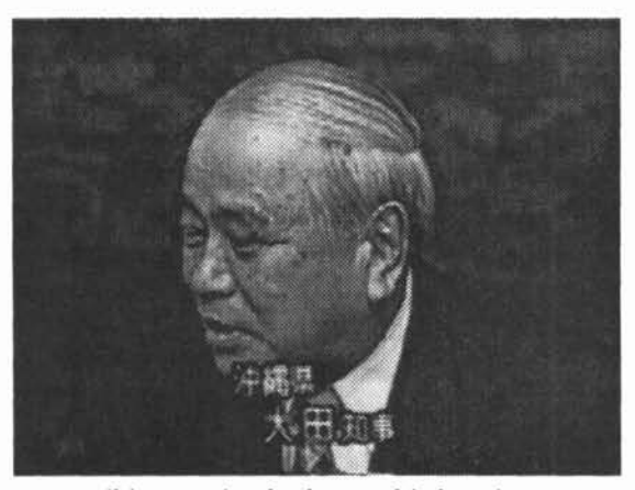
(b) texts in the lower third region