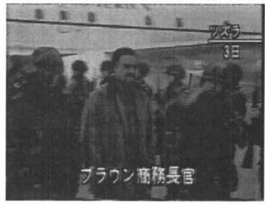
Figure 1: An Example of TV news articles (NHK evening TV newscasts; April, 4, 1996)