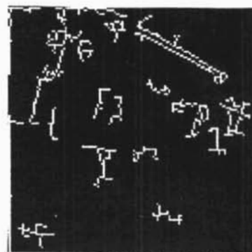
(d) interesting points at threshold 2