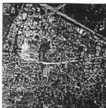
(a) original aerial image