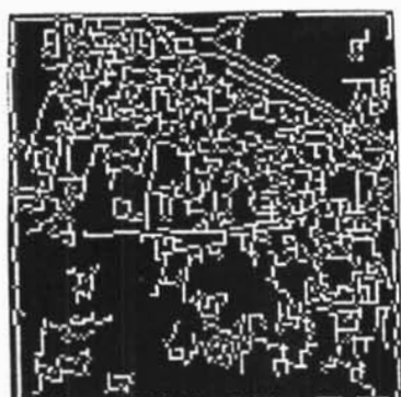
(c) interesting points at threshold 1