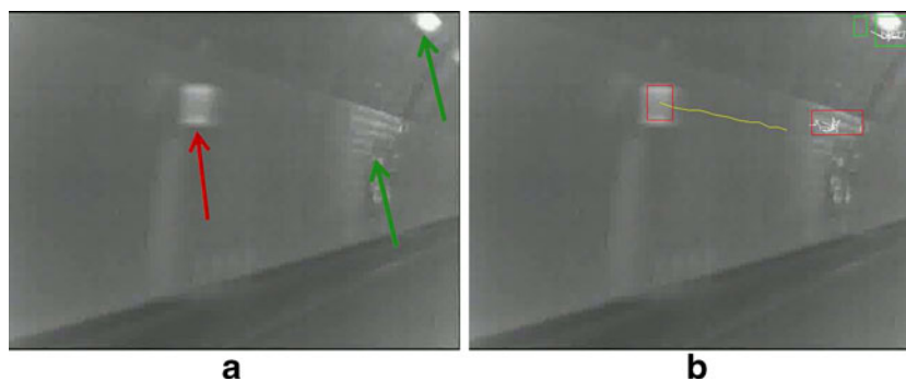
Fig. 1 Original data and detection results. In (a), the red arrow points to the target object: emergency telephone indicator, and the green arrows point to noisy objects. In (b), red rectangles mark detection hypotheses labeled as positive using appearance information, and

Most modern detection methods fall into two categories. Some [5, 8, 10, 14, 19, 25, 27, 32] follow the sliding-window schema, and they detect objects by considering whether each of the sub-images contains an instance of the target object. Classifiers are usually employed by these methods. The other methods [1, 7, 9, 16, 20–22] infer object