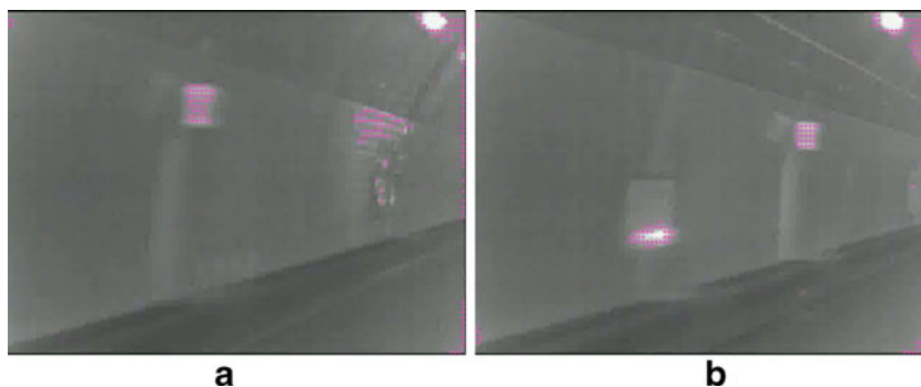
Fig. 2 Keypoint detection

For verification, the intensity histogram of each keypoint's surrounding sub-image is extracted. Then the Euclidean distance between the extracted intensity histogram and its nearest positive feature center is calculated. If this distance exceeds a threshold, D_{A_x}^{th} , it is considered negative, otherwise it is considered positive. Here, for simplicity, unlike [26], the same threshold is used for all components of the mixture.