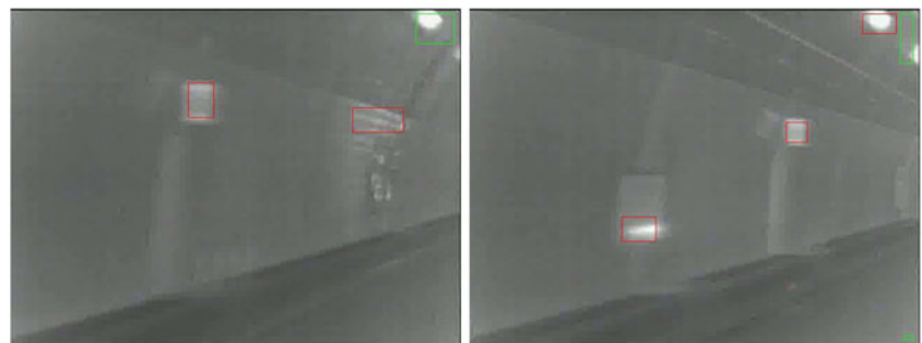
Fig. 4 Keypoint cluster verification by appearance. Red rectangles : positive detection hypotheses, and green : negative detection hypotheses

Here, P_{link}(n_g^j|T_g^i) is defined by the appearance difference, the scale difference, and the time gap between the last detection response contained in T_g^i and n_g^j . While the Hungarian algorithm [13] gives a near-optimal solution, we follow a very simple manner for the solution by finding the best matched pairs and excluding them until no matching pairs can be found.