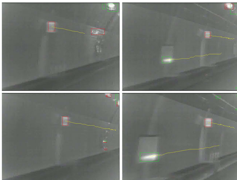
Fig. 5 Detection results

To set intensity thresholds for keypoint detection, Gaussian distribution is assumed for the points belonging to emergency telephone indicators. Following the 3\sigma principle, I_x^{th1} is set to 160 and I_x^{th2} to 190. The approximate sub-images of the emergency telephone indicators are manually marked, and used for training the mixture model of keypoint verification. The detected keypoints falling into